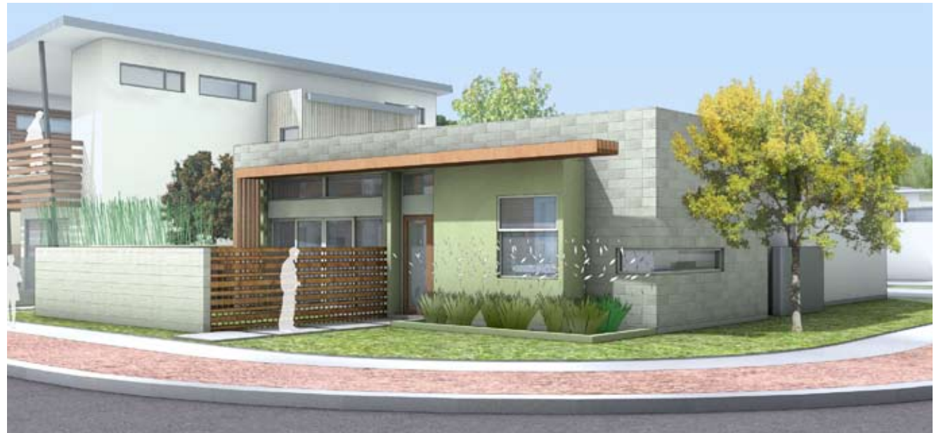
entry above sitings plan