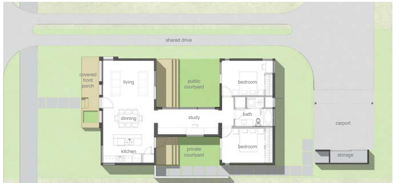
entry above sitings plan